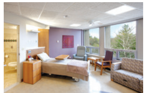
Mercy Hospice Care lobby (top) and patient room.